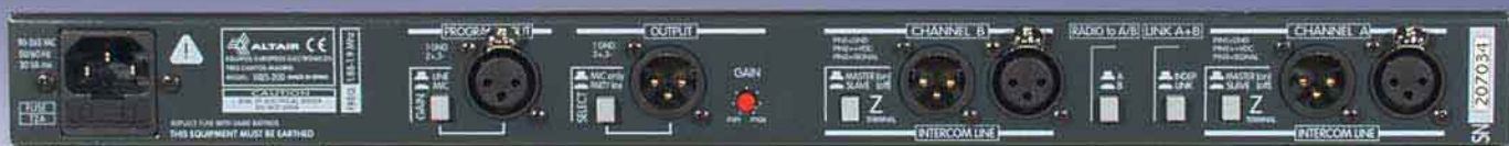
WBS-200 Rear panel